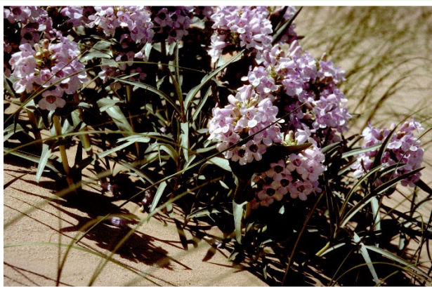
Blowout penstemon, P. haydenii.